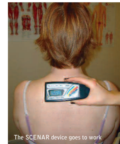
The SCENAR device goes to work

back giving way, I was more comfortable driving and the dull ache was decreasing day by day. I am now able to carry out more strenuous exercises at the gym that I couldn't do before and all pain free.